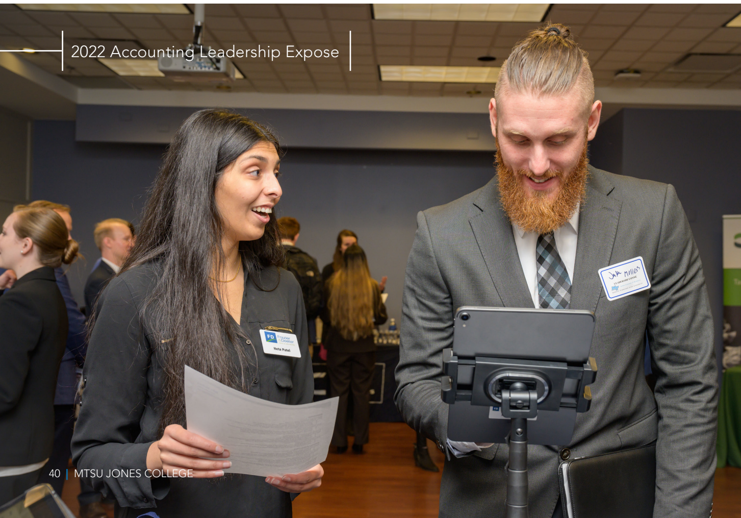
2022 Accounting Leadership Expose