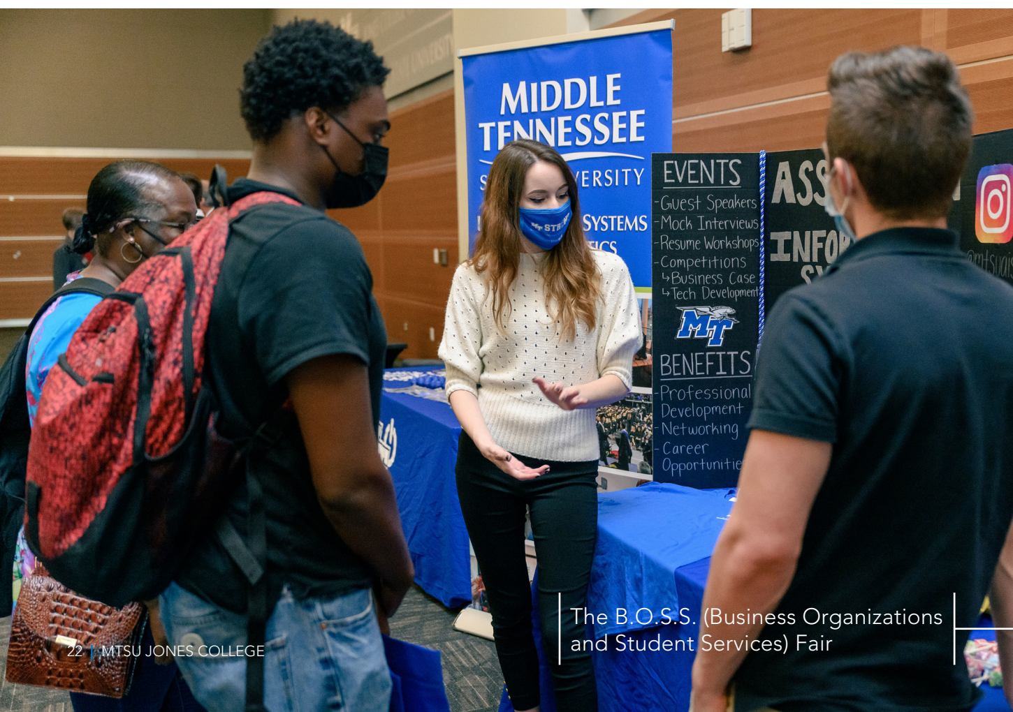
The B.O.S.S. (Business Organizations and Student Services) Fair