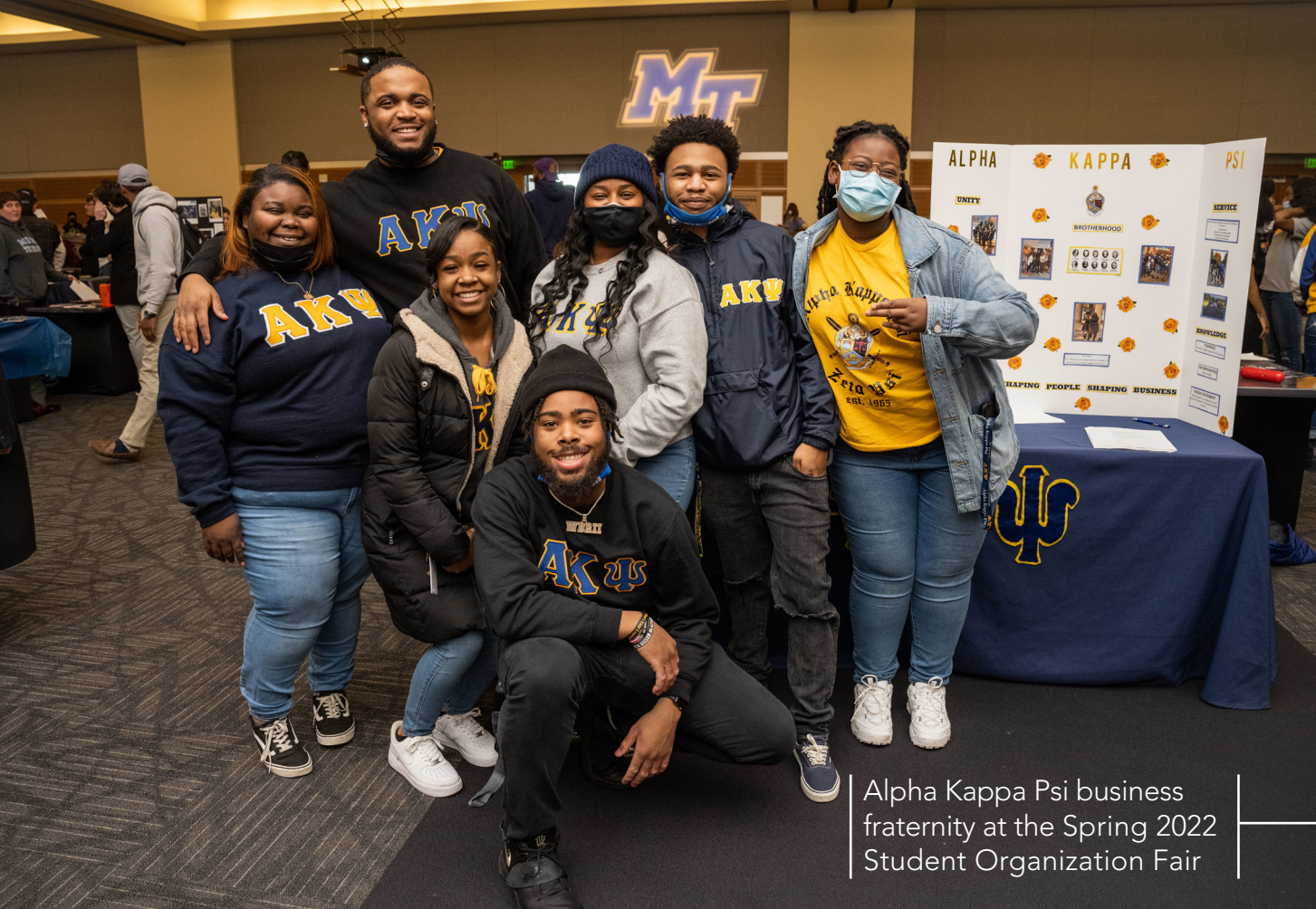
Alpha Kappa Psi business fraternity at the Spring 2022 Student Organization Fair