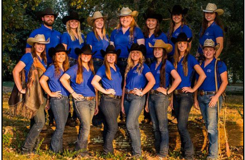
MTSU stock horse team members planned to defend their national title in late April in Sweetwater, Texas, and five members were going to compete at the first-ever National Ranch and Stock Horse Alliance Collegiate National Show (NRSHA) in Lubbock, Texas, in March, but both events were canceled because of the coronavirus pandemic.