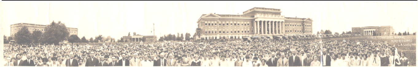
Panoramic Photo (circa 1920) - Rutledge Hall (left) and Kirksey Old Main