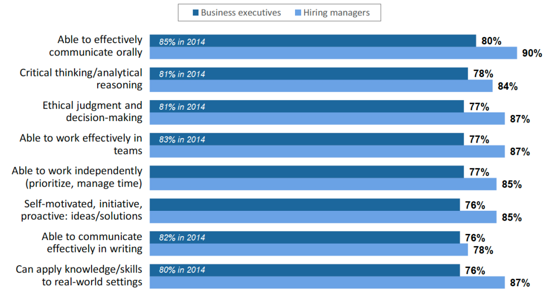
Very Important* Skills for Recent College Graduates We Are Hiring

* 8-10 ratings on a 0-to-10 scale; 15 outcomes tested