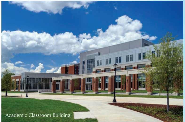
Academic Classroom Building

After a year filled with adaptations, the Applied Leadership program is set to broaden its corporate reach. When the program was created, it was designed with four in-person intensive courses required for the degree. This has often been a barrier to companies with employees outside of the middle Tennessee area, as travel expenses are not always in the budget. However, beginning this summer, the Applied Leadership program can be accessed by any company or individual, nationwide , with the introduction of regularly scheduled, remotely delivered intensives.