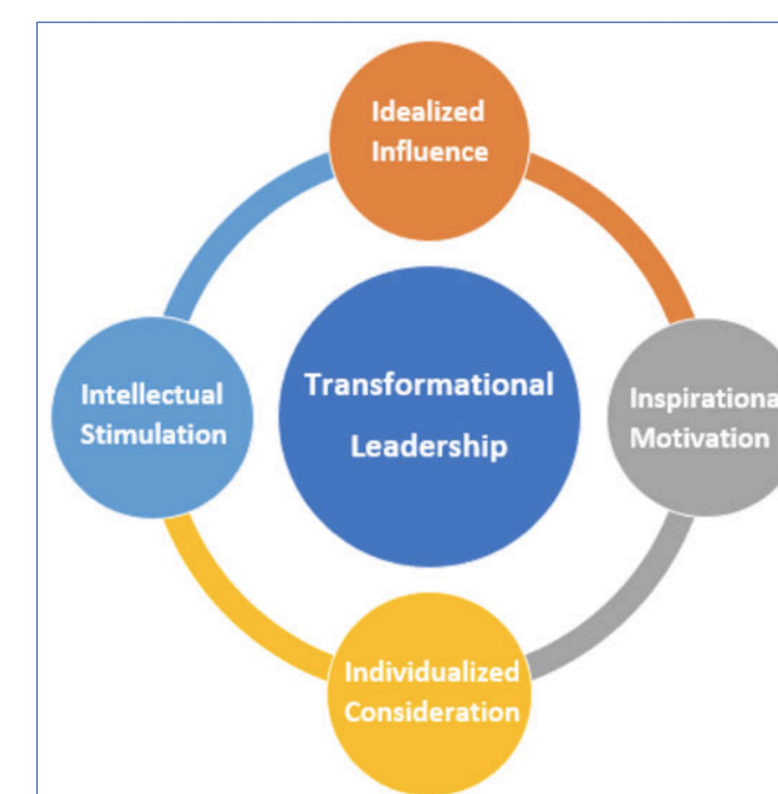
The four key factors of Transformational Leadership.

Transformational Leadership was the most preferred style of leadership by nurses and nurse leaders alike. Participants described this style as involving teamwork, collaboration, and innovative thinking. It was described as the most balanced style of leadership, as Transformational leaders are neither absent nor micromanagers. One particular unique finding provided a level of detail that is not available in current nursing burnout literature: a few nurse managers explained that when staff nurses wish to meet to discuss an issue, they must bring at least one suggested solution. This prevents excess complaining and invites nurses to become involved in shared decision making. This method ensures that burnout is mitigated for both the nurse and nurse leader.